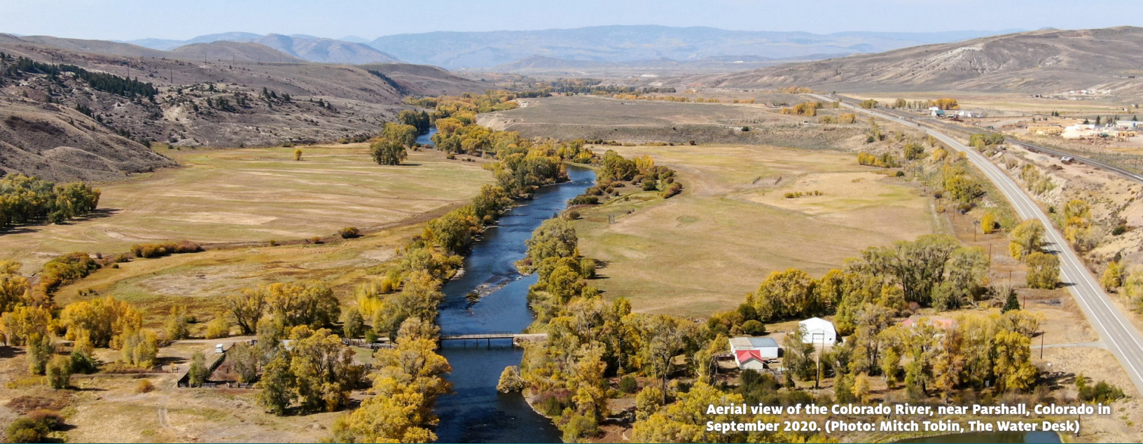
Aerial view of the Colorado River, near Parshall, Colorado in September 2020.