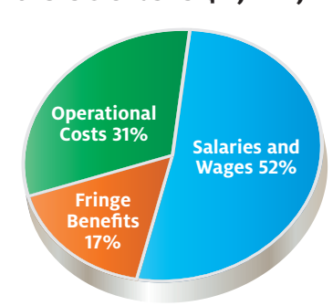
2015 USES $2,280,799