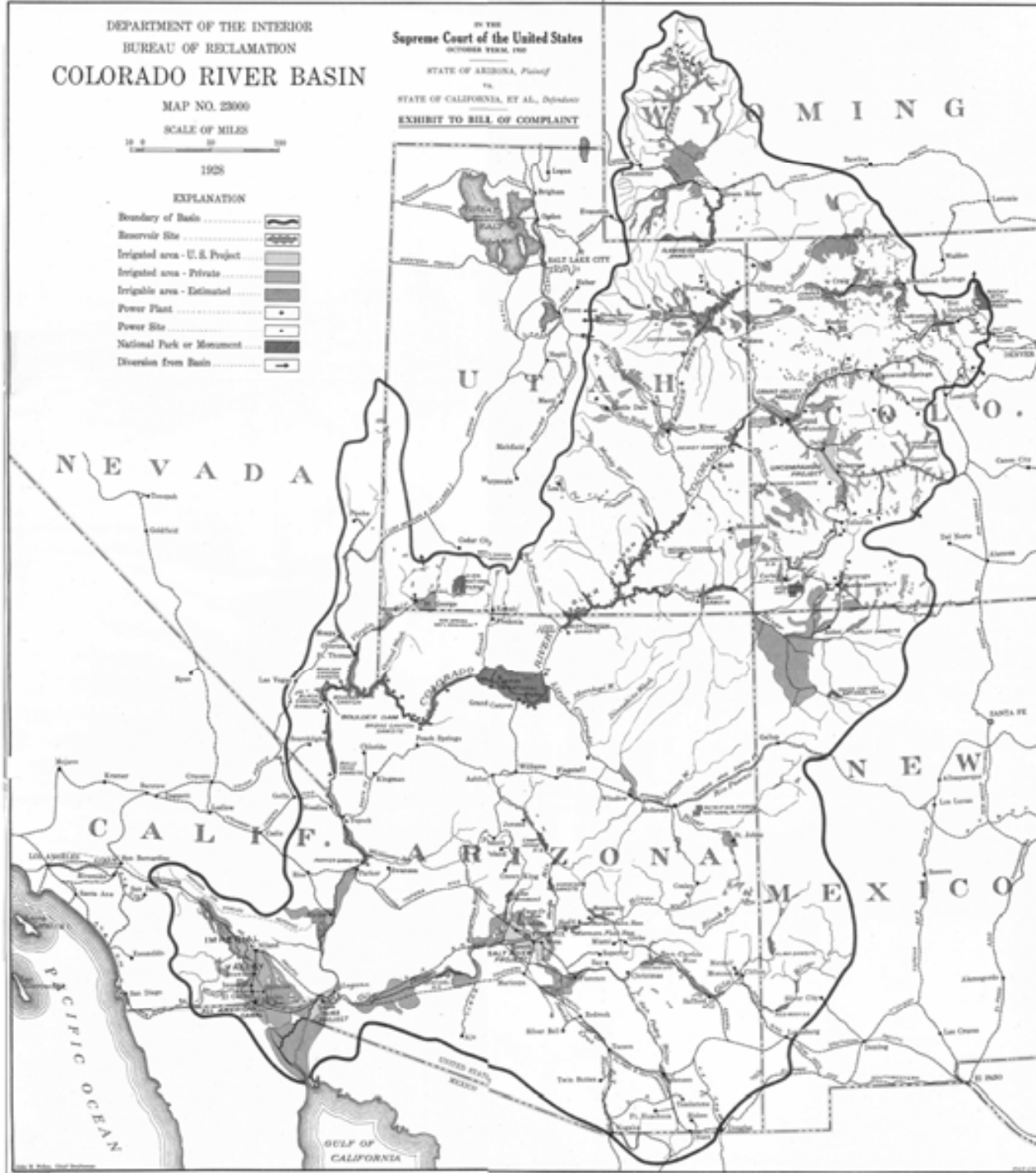
EXHIBIT TO BILL OF COMPLAINT