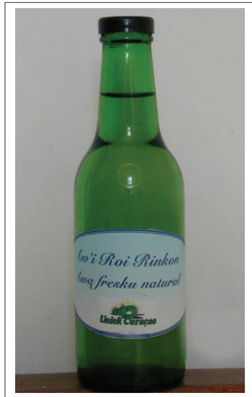
Figure 3. A bottle of groundwater (from spring at Roi Rinkon, Curaçao) given as a gift to remember that this was once a usable resource on the island (Water for Life Conference, Curaçao 2003). The front label (in Papiamentu) reads “Awa fresku natural” (Natural fresh water). However, as the aquifer is contaminated, a label on the backside of the bottle reads “Not for consumption.”

In arid and semi-arid areas, water is an especially precious commodity. In Israel, water scarcity was the trigger for considering rain water recharge at home-scale level (e.g., by directing infiltration of rain water falling on the roofs into the subsurface) as a worthwhile water-saving approach. This may be an appealing methodology if the unsaturated zone is analyzed for the existence