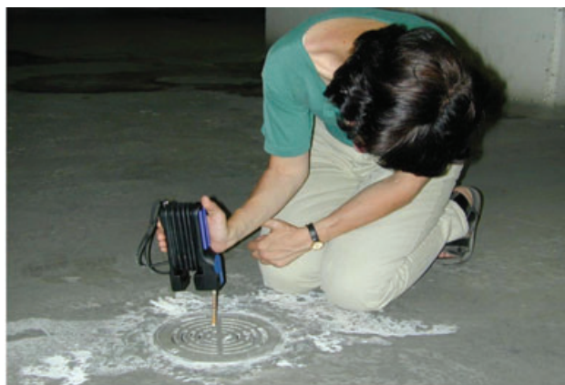
Figure 1. Measuring 822,000 µg TCE/m 3 air emanating from a water drain in an underground parking lot of a building located in a VOC contaminated area of the Coastal Plain aquifer of Israel (Israel maximum level for 24-h exposure = 1000 µg TCE/m 3 air). The drain opening is about 5 m above the water table (water table depth ~18 m below ground surface; after Graber et al. 2000). The building is located about 500 m from monitoring well M5A (Figure 4). Note that volatilization is considered to be one of the natural attenuation processes.

Thus, we postulate that neither “brute-force cleansing” nor “natural attenuation” can be adopted uncritically, and that either approach requires prior quantitative analysis of likelihood of success based on available