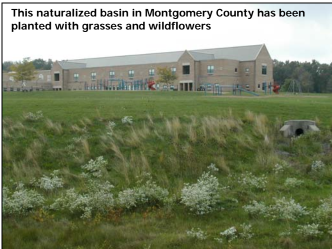
This naturalized basin in Montgomery County has been planted with grasses and wildflowers

An extended detention basin and rain garden planted with a variety of wet meadow plants provides better treatment of stormwater and poses less of a mosquito problem than a basin planted with turf grass because frogs, dragonflies, and birds that will thrive in a wetland meadow ecosystem will act as natural controls.