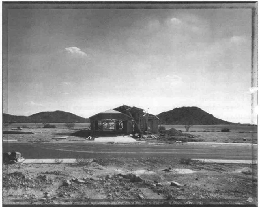
Growing houses on desert lands. As Arizona's population expands new housing developments are being built on former agricultural lands. Some of these lands have been extensively pumped for groundwater and may be areas of future subsidence. Subsidence will likely attract greater public interest as home and property owners experience its effects.