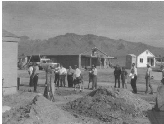
This new subdivision is the site of an innovative water conservation effort, as dual meters to measure indoor and outdoor water use are installed.

For additional information about the dual-metering project contact Val Little at 520-792-9591, ext. 12; email: vlittle@ag.arizona.edu