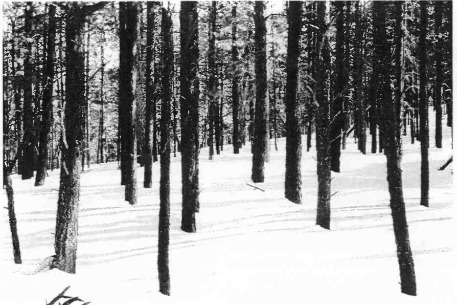
Ample snowfall in Arizona through December has produced snowpack water equivalency of 160 percent of normal in the Salt-Verde Basin, 150 percent of normal in the Gila Basin, and 200 percent of normal in the Little Colorado Basin.