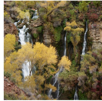
Image: Bruce Gungle, Grand Canyon Thunder River. WRRRC 2014 Photo Contest

Coconino County contains parts of three national forests: Kaibab, Coconino, and Apache-Sitgreaves, covering over 2 million acres of woodlands within county borders—larger than Yellowstone National Park and nearly twice the size of Delaware. As climate change and ongoing drought conditions intensify, so does the risk of fire danger. The Four Forest Restoration Initiative (4FRI) works within these national forests in Coconino County and across northern Arizona to restore fire-adapted forest ecosystems. 4FRI aims to create resilient forests that support natural fire regimes, reduce severe wildfire risks, and foster habitats for native plants and animals. It includes over 30 stakeholder groups and spans 2.4 million acres in the project area (1.1 million found within Coconino County). Key goals include accelerating restoration treatments, supporting sustainable forest industries, and improving Forest Service practices. Since its inception, 4FRI has treated over 700,000 acres through thinning and controlled burns. To learn more about forest restoration and other sustainable water resources management efforts in Coconino County, check out the Coconino County Water Factsheet at the link below.