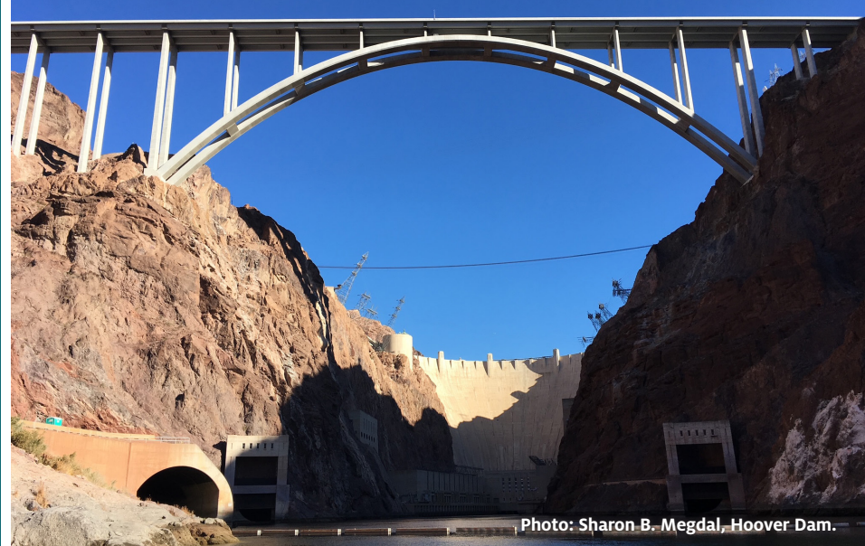
Hoover Dam.