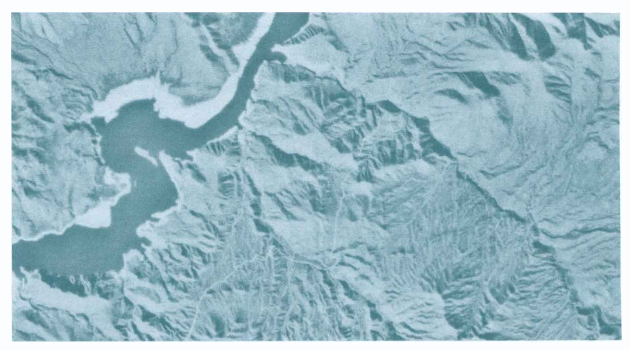
The ridges, slopes and contours that direct flow and define a watershed can create a beautiful pattern as is shown in this aerial view. Human effects on the watershed also are apparent. Most noticeable is Apache Lake, formed by Horse Mesa Dam on the Salt River. Roads also can be seen.